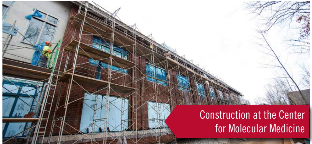
Construction at the Center for Molecular Medicine

A new school year brings about several changes around campus. From new construction at the Center for Molecular Medicine and Phase II of the Business Learning Community, to