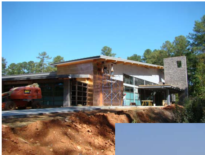
The Rock Eagle Dining Hall should be finished by mid-January.

Another intramural project in progress is the construction of the Redcoat Marching Band Practice Field at what is currently known as Field #9 in the existing intramural complex. This expansion will provide the Redcoats with their own practice site (avoiding scheduling conflicts with the football team) and will supply additional parking and bus access. Completion is scheduled for January.