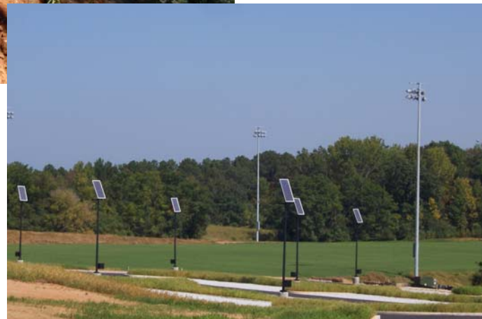
The University's new Club Sports Complex integrates green technologies with a rustic setting.